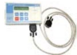
RVS-DX Remote Keypad (IP 54)