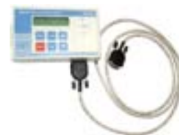
RVS-DN Remote Keypad (IP 54)