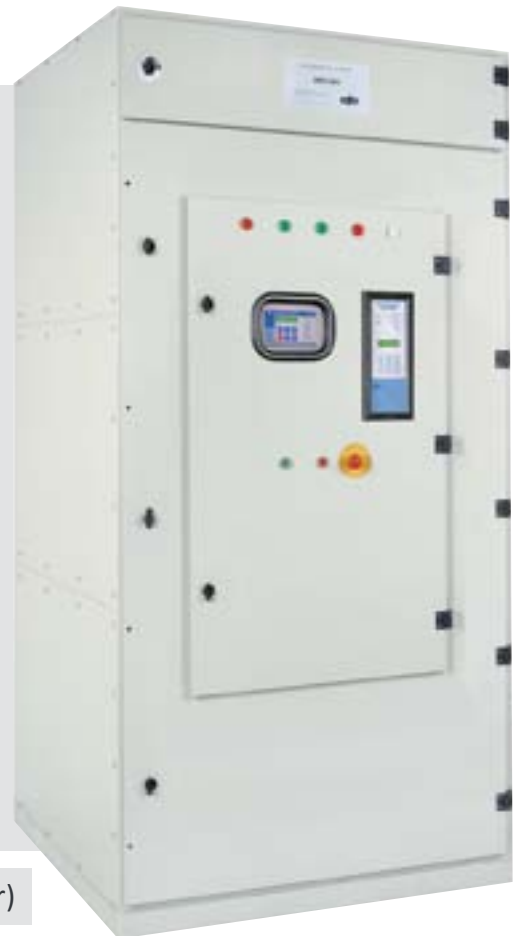
HRVS-DN (Standard Switchgear)