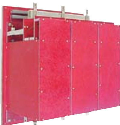
Soft Starter Power Module