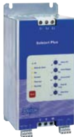
Solstart Plus 72